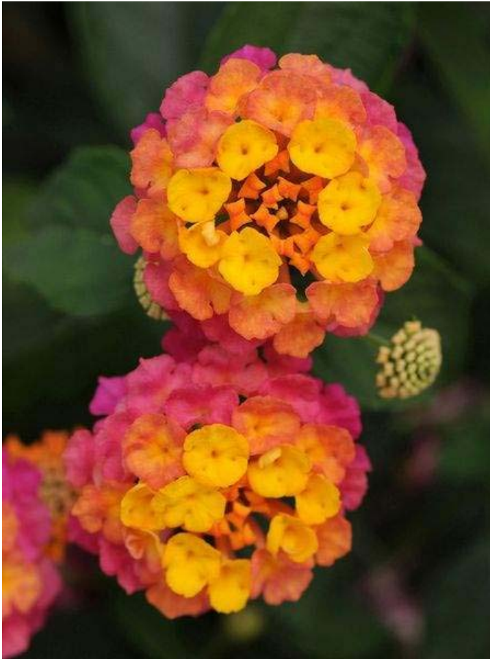
Lantana 'Lucky Sunrise Rose'(Ball Horticulture)

it's finally spring! What a relief, after these past six weeks of gloomy, stormy weather — can we talk about that groundhog now? Here's to the return of electricity for nearly all of us and a look ahead to a glorious season, hopefully, of warm days and pretty flowers.